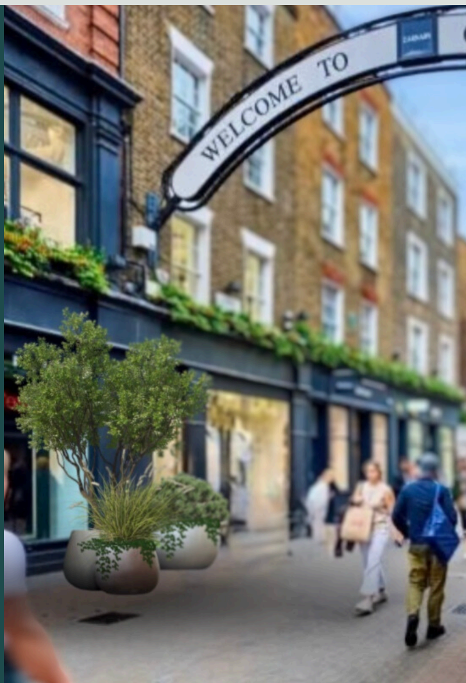
Proposed Street View

All planting has been chosen with sustainability and seasonality in mind. The stock is peat free and UK sourced, with a preference for UK grown plants.